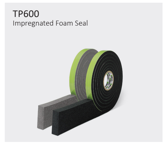
TP600 Impregnated Foam Seal must be applied in accordance with manufacturer's guidelines.

CPG UK TP600 Impregnated Foam Seal is the product DOVISTA UK approves for primary weather seal applications. TP600 has full BBA approval and has been extensively tested to ensure performance and compatibility.