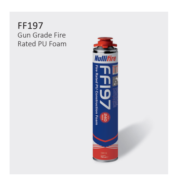
{\sf FF197} Gun Grade Fire Rated PU Foam must be applied in accordance with manufacturer's guidelines.

Should there be a project specific requirement for the application of a fire rated PU Foam DOVISTA UK would recommend the use of Nullifire FF197.