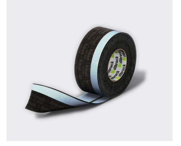
ME508 Duo Membrane EW/F must be applied in accordance with manufacturer's guidelines.

Duo Membrane EW/F- Peal and Stick Internal Air & Weather Membrane