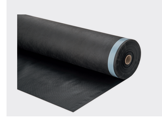
ME010 Façade UV and Fire Membrane must be applied in accordance with manufacturer's guidelines.

ME010 Façade UV and Fire Membrane – Meets B-s1-do with SP025 Adhesive