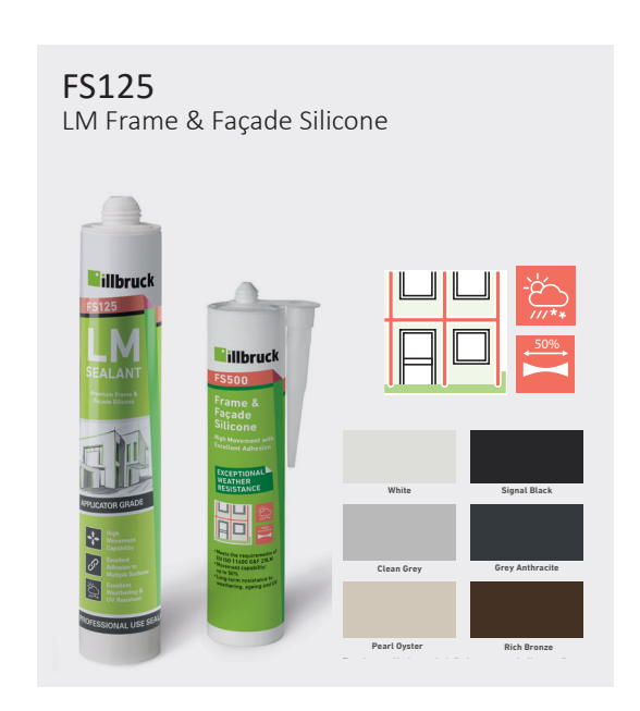
FS125 LM Frame & Façade Silicone must be applied in accordance with manufacturer's guidelines.

Where defined by DOVISTA UK there may be situations where a TP600 Impregnated Foam seal is not conducive to the build interface or product type.