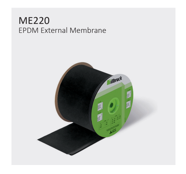
ME220 EPDM External Membrane must be applied in accordance with manufacturer's guidelines.

ME220 is used for weather sealing the connecting joint between or a façade and the adjacent structure, or to provide an internal air-tight barrier.